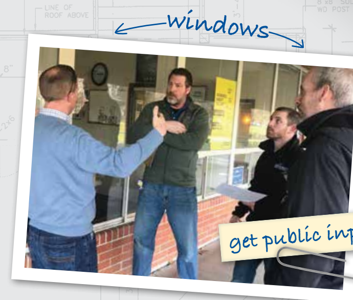
get public input