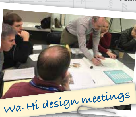
Options discussed with staff -

Roof consultants inspect the Berney Elementary roof. The 40-year-old school will get a new roof and HVAC system this summer.