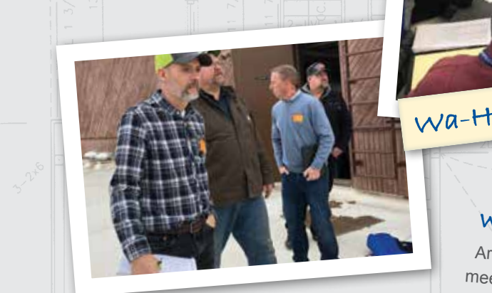
Berney roof inspection -

Glass experts from Perfection Glass of Walla Walla, toured Wa-Hi to look at the school's windows. They will be installing window samples this spring to help determine the best solution to improve efficiency and safety. Community members will be asked to weigh in on window options.