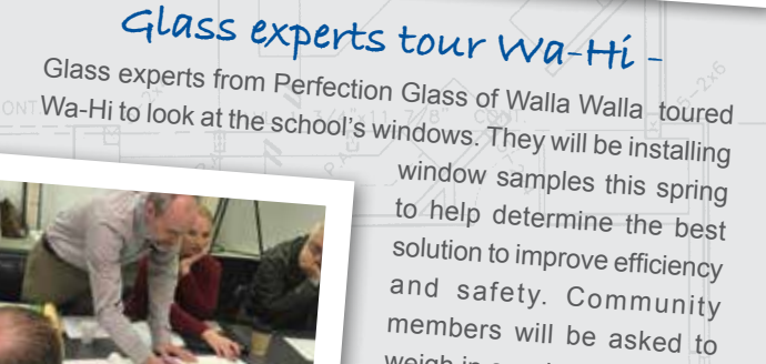
Glass experts tour wa-Hi -

Soil samples are taken at Walla Walla High School as planning continues to renovate the 56-year-old school. Construction on the new science addition will begin fall 2019 with improvements to other buildings to follow next summer 2020.