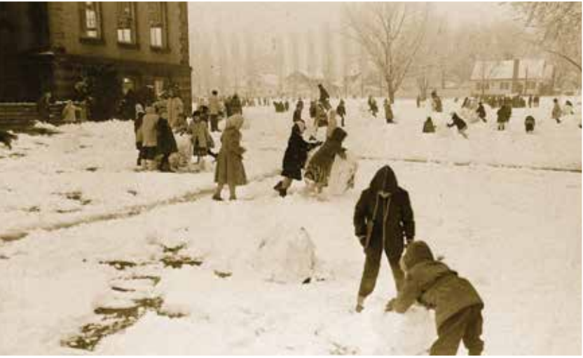
Green Park Elementary students play in the snow during recess in 1959.

Walla Walla Public Schools is an Equal Opportunity Employer and complies with all requirements of the ADA.