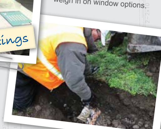
Blue Ridge roof exploration -

Architect Kevin Cole meets with Wa-Hi staff members to discuss design options as part of the Education Specifications phase of the project.