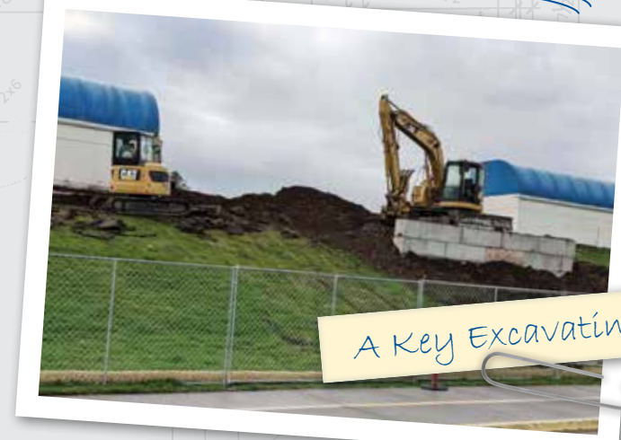
A Key Excavating