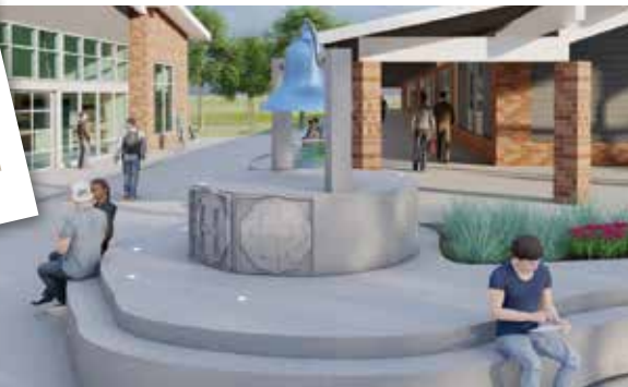
Architect's rendering of the next generation Spirit Bell which will be constructed near the school Commons.

donated a 1980 penny, nickle, dime and quarter, Susan B. Anthony dollar and 1979 $1 and $2 bills for the time capsule.