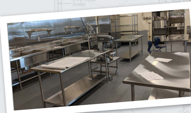
New culinary arts classroom A new state-of-the-art culinary arts classroom is part of the improvements.