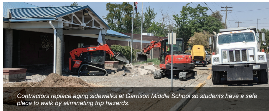
Contractors replace aging sidewalks at Garrison Middle School so students have a safe place to walk by eliminating trip hazards.