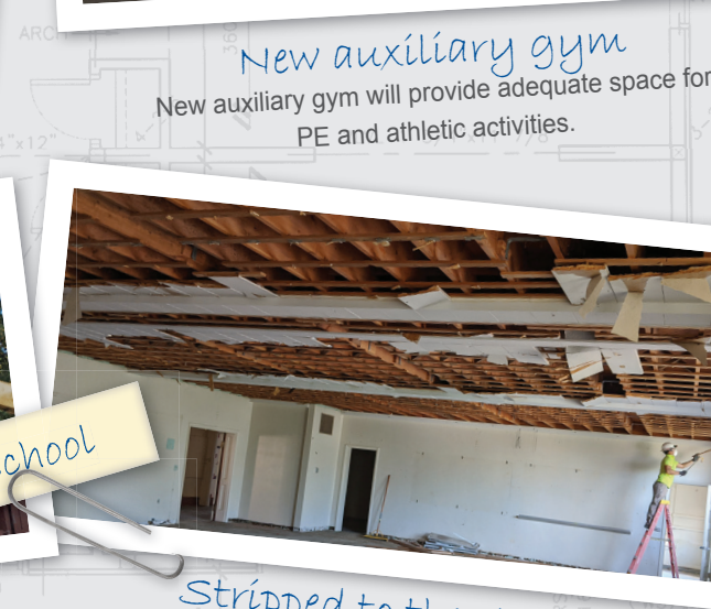
Stripped to the studs Classrooms are being demoed in preparation for modernization.