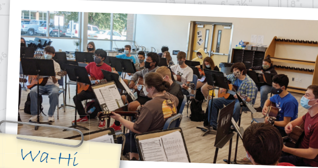
New music building addition Features larger classrooms, natural light, improved acoustics, practice rooms and instrument storage.