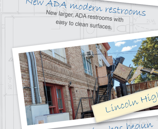
Renovation has begun Abatement of asbestos underway.