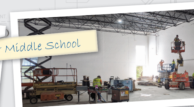
New auxiliary gym New auxiliary gym will provide adequate space for PE and athletic activities.