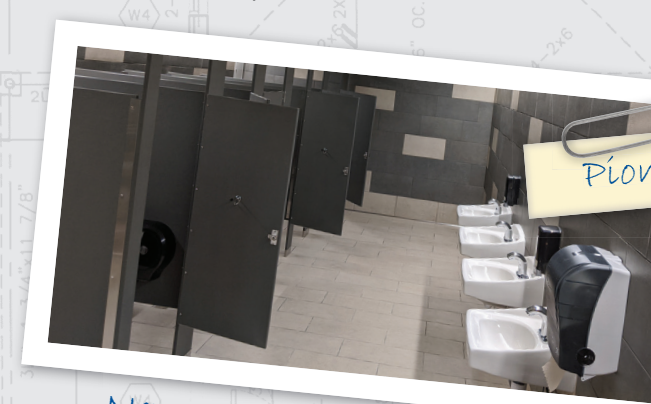
New ADA modern restrooms New larger, ADA restrooms with easy to clean surfaces.